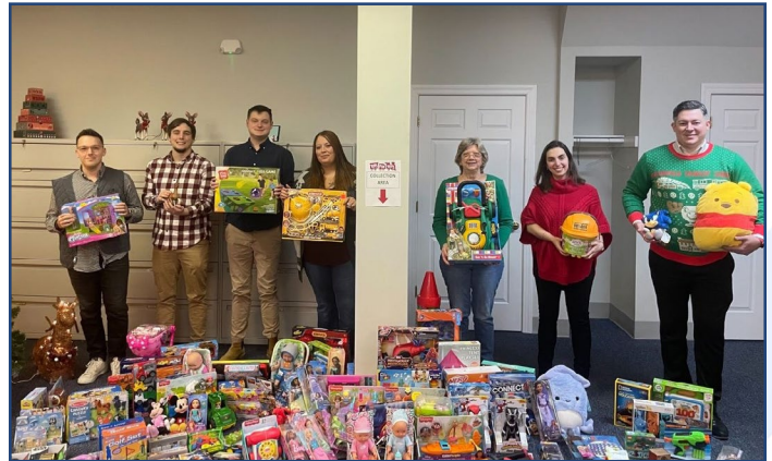
Top images: United Way / Toys for Tots annual food and toy drive at the corporate office