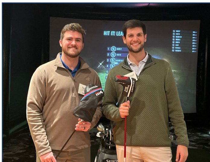
Left image: Longest Drive and Closest to the Pin competition raises nearly $2,200 for UNICEF during the annual Handy Distribution Charity event